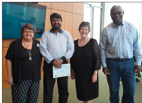
ABD Workshop participants