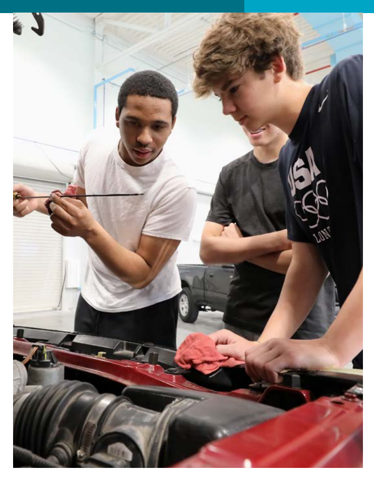
Basic Car Care