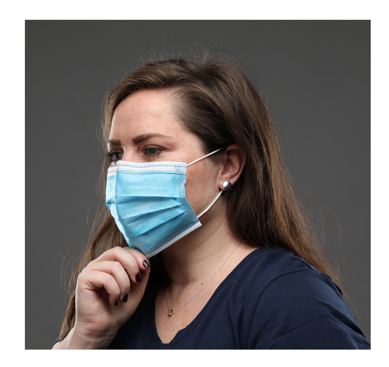
Pull bottom down,

Mold to shape of nose and fit snugly against sides of face.