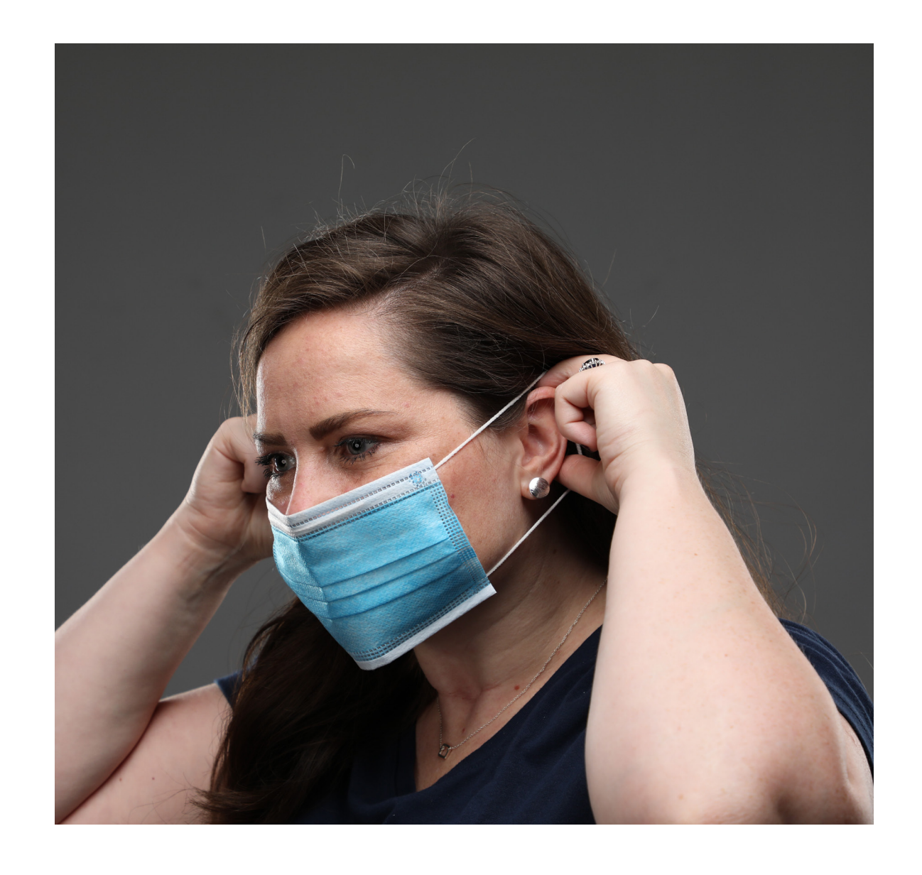
Secure with ear loops or ties.