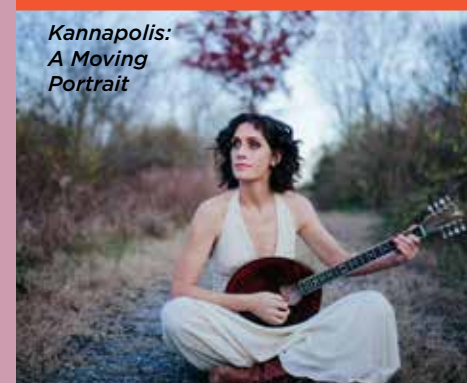
Kannapolis: A Moving Portrait