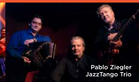
Pablo Ziegler JazzTango Trio