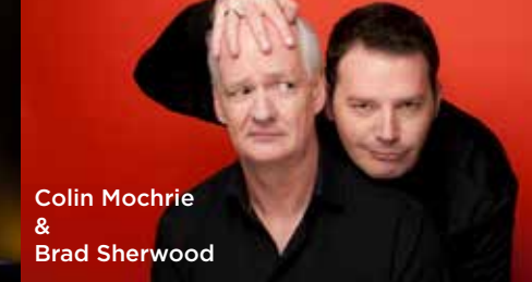
Colin Mochrie & Brad Sherwood