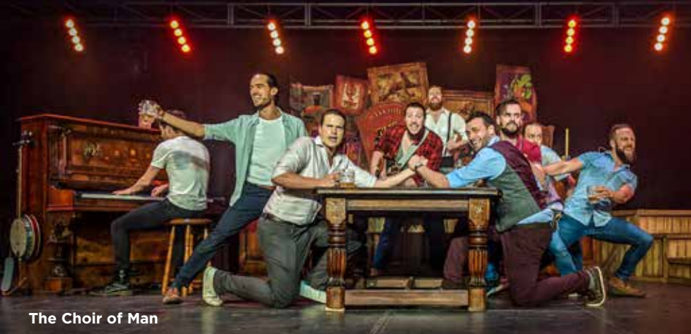
The Choir of Man